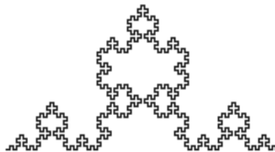
Figure 2: A von Koch fractal based on a very simple shape

There are various definitions of what a fractal is. If an object A, is similar to object B then object A or B, is a zoomed version of the other. A fractal is usually self-similar. That means that it repeats itself. For an example, look at the following fractal of Figure 2. In this fractal the original pattern repeats itself re-generating itself at the whole.